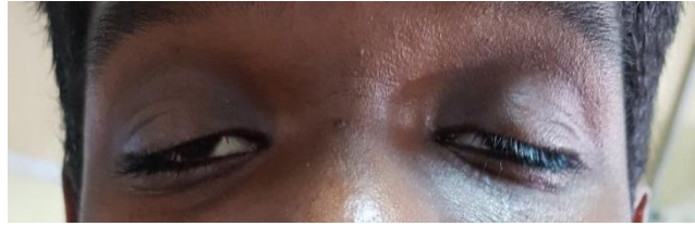
Figure 01. Pharyngeal and facial muscle weakness Figure 02. Worsening of ptosis.

After development of late onset neurological manifestations at 23 hours from the bite he was not treated with AVS. He was kept nil by mouth and continued monitoring of blood pressure, pulse rate and tidal volume for next 16 hours. He was hydrated with intravenous 0.9% sodium chloride 100 ml/ hour . His serum creatinine was 97\mu\text{mol/l} , \text{Na}=138\text{mmol/l} , \text{K}=3.9\text{mmol/l} , corrected Ca 2.45\text{ mmol/l} ,WBCT =normal ,INR= 1.5,Creatinine kinase= 3900\text{ IU/l} , Blood picture showed low grade microangiopathic haemolysis.